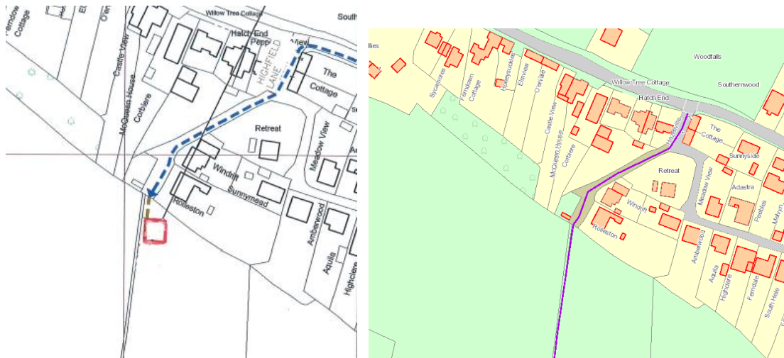
Right of Way – Footpath REDL25 identified in purple

The application site is located in a field that is part of Ridge Farm situated adjacent to the settlement boundary for Woodfalls. A ROW runs southwards from a farm access located at the end of a track that is accessed off Highfield Road. The site lies south of dwellings in Highfield Lane.