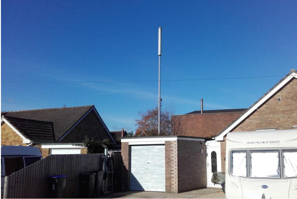
Existing Mast to rear of Springfield Crescent (to be removed)

The location of the proposed site is a field to the rear of properties in Highfield Lane. In this location, it is removed from the urban context of the current mast, but seen from distant views against the backdrop of existing development and trees/vegetation that form the current interface between the built development and the field. There are also overhead electricity cables and poles in the vicinity. The field is not in a protected or sensitive landscape, being outside of the National Park and not within any AONB. Whilst the mast that has deemed consent would be a more intrusive element in the landscape, it is not considered that the slimline mast would have such a significant effect. It would also be possible to paint the supporting column in a recessive colour. Whilst it will be clearly visible from the public right of way adjacent, it would be seen in close association with the existing electricity pole stay and apparatus. Overall, it is considered that the visual impact from the proposed slimline mast would be acceptable in this location.